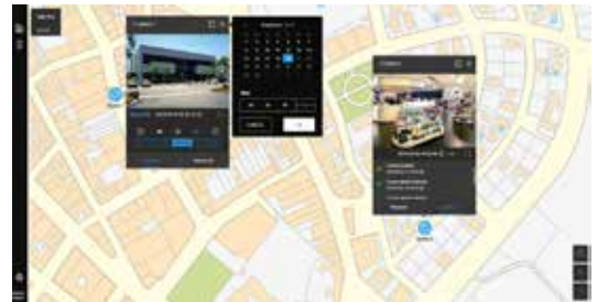
MAXPRO VMS Security Console

With MAXPRO VMS R600 release, a brand new Security Console web client is introduced, offering intuitive map navigation across sites, buildings and floors, and camera live view pop-up, instant playback and alarm indication on maps, which enables customers to obtain situational awareness and manage their facility efficiently.