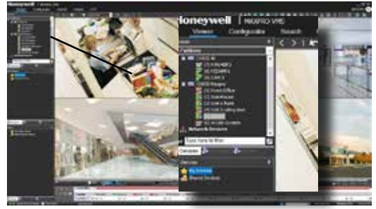
MAXPRO VMS Client Viewer 2x2

MAXPRO VMS is ideal for facilities requiring at-risk critical infrastructure protection such as airports, seaports, large multi-site commercial buildings, casinos, and other high-profile facilities. It is the perfect client-server video management solution for locations requiring the use of both digital and analog technologies.