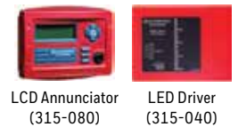
LCD Annunciator (315-080)

The LCD annunciator allows to monitor & control the Fire Alarm Control Panel (FACP) from areas away from the panel whereas the LED driver module is used to drive the most customized graphical annunciators.