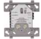
Addressable Control Module (HM-DCMO-UL)

Allow other fire detection or sensing equipment to be interfaced with the control panel, e.g. sprinkler flow switch or a relay to “ground” a lift.